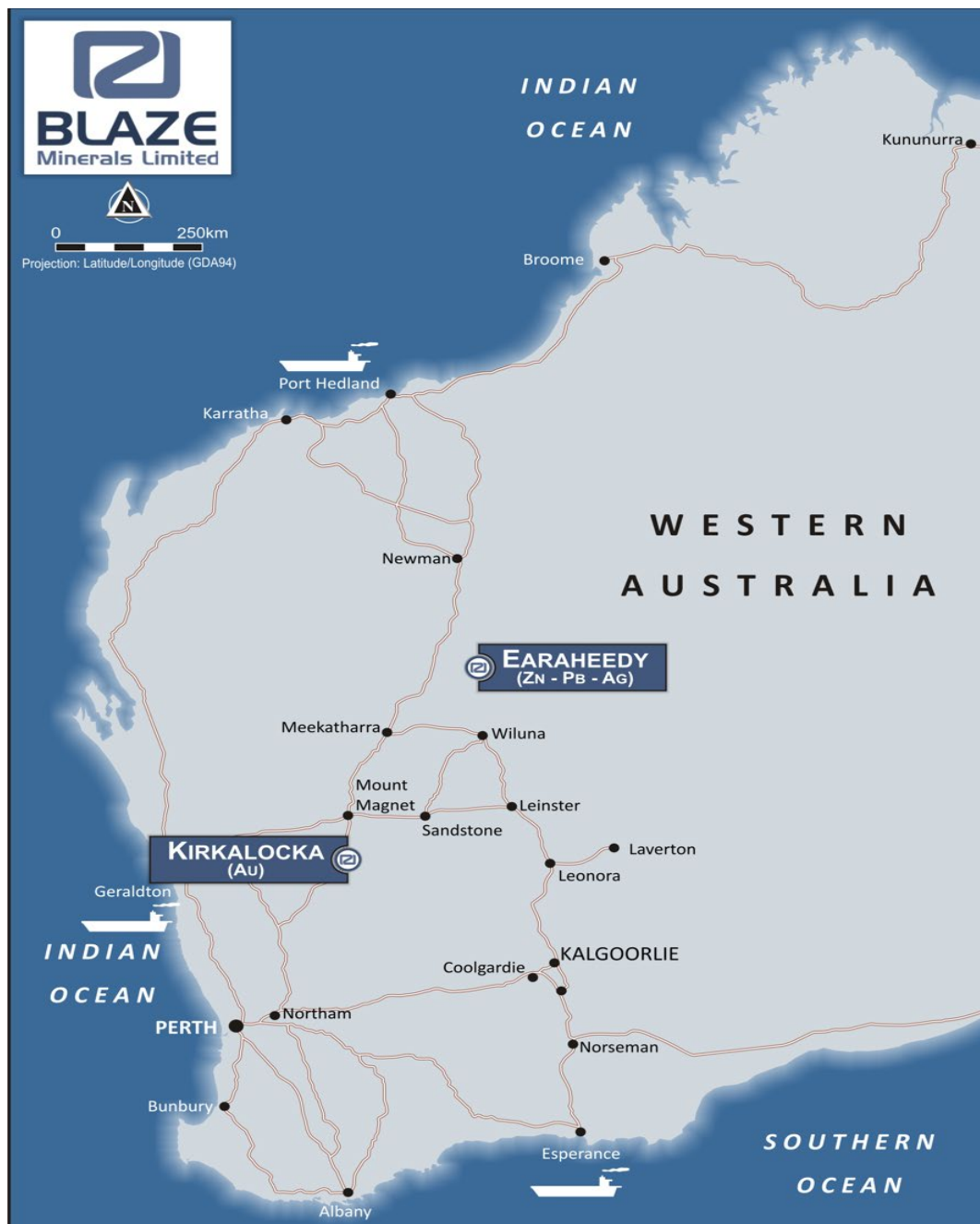
Figure 1: Blaze Minerals Limited Exploration Projects

Following detailed geological review tenement E69/3885 was relinquished during the reporting period.