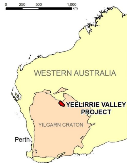
Figure 1 – Location of the Yeelirrie Valley project

The Yeelirrie Valley Uranium Project (Figure 1) is located in the north of the Eastern Goldfields of Western Australia, some 650 kilometres to the northeast of Perth. The project surrounds BHP-Billiton's Yeelirrie uranium project.